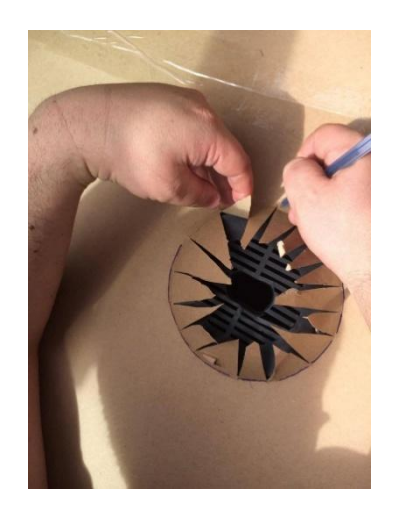
Line drawn around seat/tables bases.

16. Put a line of tape down the middle of the template to show the direction of the carpet lines.