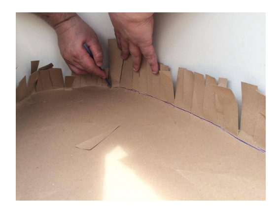
Line drawn in the crease of the folds.

15. Draw round the edges of the floor and seats/tables with a pen to show exactly where the carpet needs to come up to. This pen line needs to be drawn right in the crease of the folds you have made around the edges of the boat (as shown below) to ensure a perfect fit.